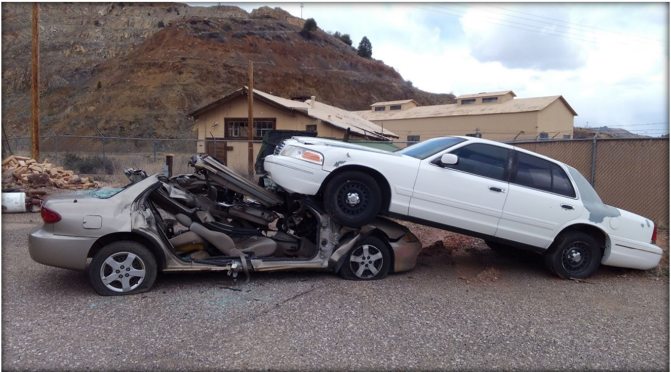
Setup for extrication training.

Volunteers have been training with the new battery-powered extrication equipment and stabilization equipment. We have had to use our old extrication tools numerous times throughout the years. These new tools are much quieter and will allow us to perform extrication efforts in less accessible areas. Let's hope we never have to use them.