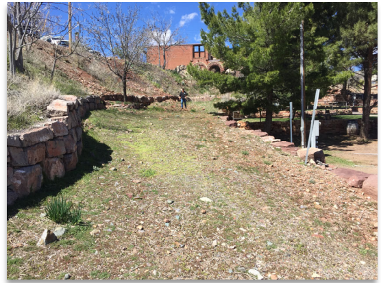
Future site for the Jerome Community Garden!