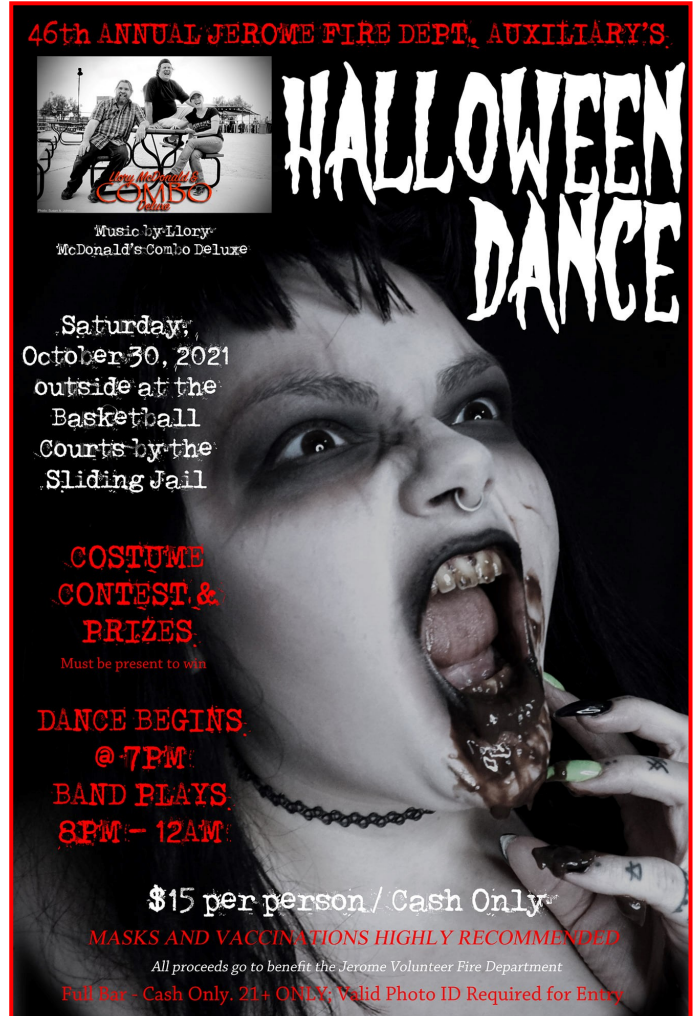
Poster art by April Hernandez

Please remember that if you need assistance with Firewise activities, you must fill out a Firewise application and submit it to the Fire Department before work can be approved. Applications can be obtained at Town Hall or the Fire Department or online at https://www.jerome.az.gov/forms-and-applications .