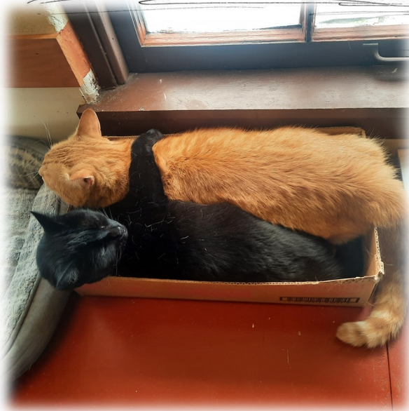
Abracadabra giving Wyatt a hug.