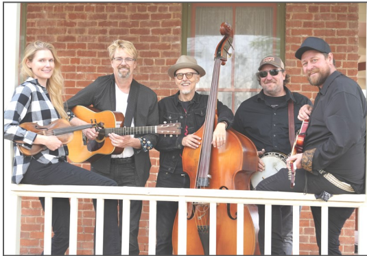
Ten Dollar Wedding / Playing at the Jerome Town Christmas Party December 7th

is back! Save the date for Saturday December 7th from 5pm to 8pm and bring your signature dish! We would love to see everyone and celebrate the community. Bluegrass favorites Ten Dollar Wedding will be our entertainment for the evening along with a silent auction and beer and wine bar.