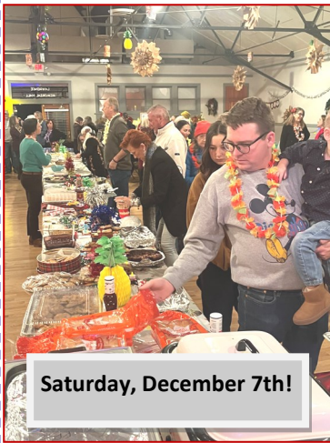
Saturday, December 7th!

Believe it or not, the holidays are coming up quickly. Mark your calendars for Light Up The Mountain on Saturday, November 30th! The Mingus Union Choir, local favorites 'Thunder and Lighting', pictures with Santa and much more! We will have various events during the day and we light up the mountain just after sunset with our new decorations from Copper Canyon Christmas.